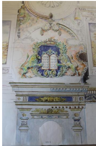
Their beautiful record paintings