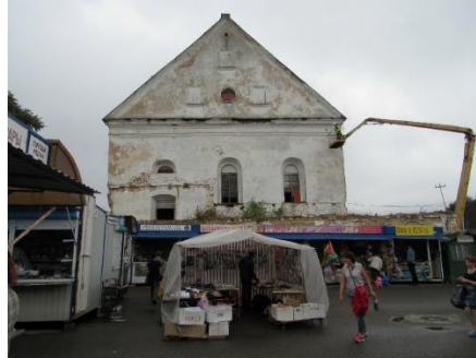
Installing the crack monitors

We could show that we have already repaired loose roof sheets and most recently installed devices to assess if the walls, which have significant cracks, are moving. They have to be left in place for some months before any result becomes available in about May 2020. This progress has been possible because of significant donations from members of the Kaplinsky Family. Some have been very considerable contributions. We warmly thank you for that.