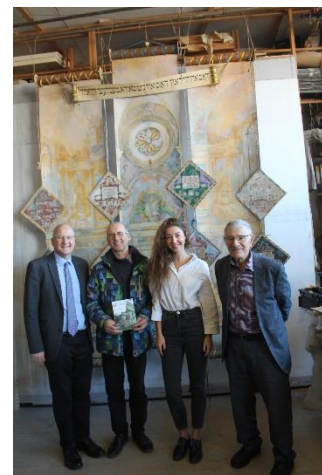
With Members of the collective

We came well prepared with ideas and proposals for the mayor of Slonim, as success depends on his support. He is focused on growing the local economy quickly and smartening up the town. To get his full support we need to demonstrate that we are serious and capable. There have been many initiatives in the past to save the synagogue but they have come to nothing.