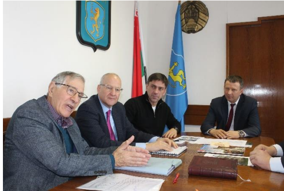
Negotiating with the Mayor

Our original idea was to undertake minor repairs to keep the weather out and then to conduct a detailed and long feasibility study to decide on the facilities that could be provided, to cost them and to develop a business plan. That suggested a 10 year timetable, too long for the mayor. Instead, after the initial minor repairs we will provide a small visitors centre in the form museum/meeting place and facilities to view the interior of the synagogue without doing any internal works. The exterior will be restored shortly after so that the building is not an eyesore. This will create an opportunity to display the Jewish story in Belarus and provide a tourist attraction much more quickly. The photographs show the idea. In retrospect this is a much better approach. A second stage will consider future uses of the building and how the interior could be improved.