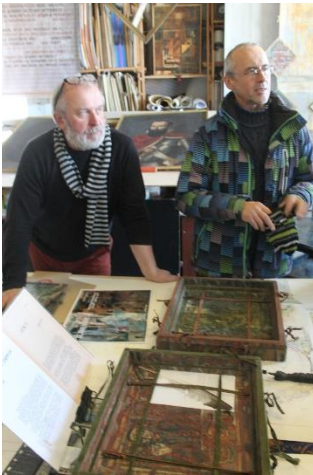
Members of the singing collective

museum to be. Where ever we went we found surprising connections and support. The Chief Rabbi of Belarus has given us his full support.